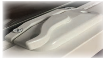
Double Hung Lock

Atlantic Performance windows come standard with the industry's finest hardware system. Low profile operators, locks, and hinges have all been developed to work together to meet or exceed industry performance requirements.