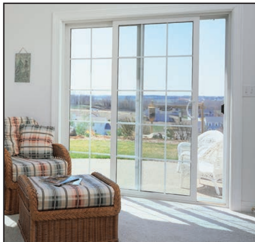
Sliding Patio Door

Create light and inspirational views in your living space