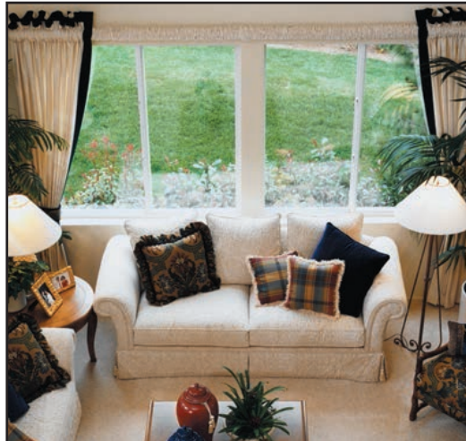
2 & 3 Lite Sliders

A great choice when space is at a premium