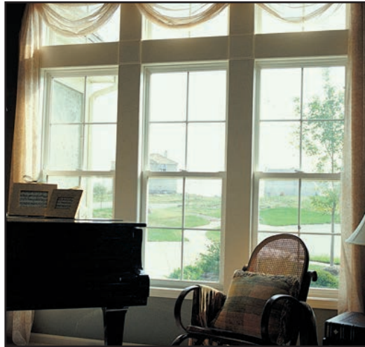
Double-Hung and Transom Windows

Bring added height and light to any room setting