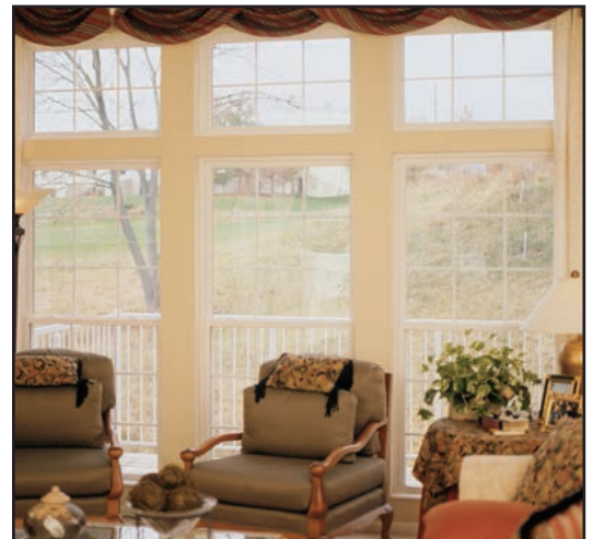
Picture Window Walls

Create light and inspirational views in your living space