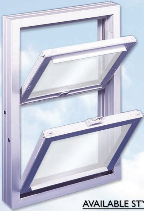
AVAILABLE STYLE: DOUBLE HUNG